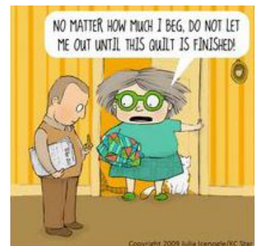
Quilt Show Panic, Stage 2: The All-Nighter

I believe that God would not have made me so creative if he/she wanted me to clean the house everyday (or month).