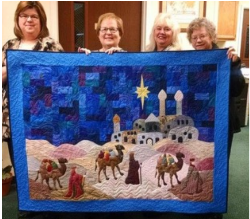
Gathering of Quilter's Guild presents Holland Free Methodist Church with nativity quilt